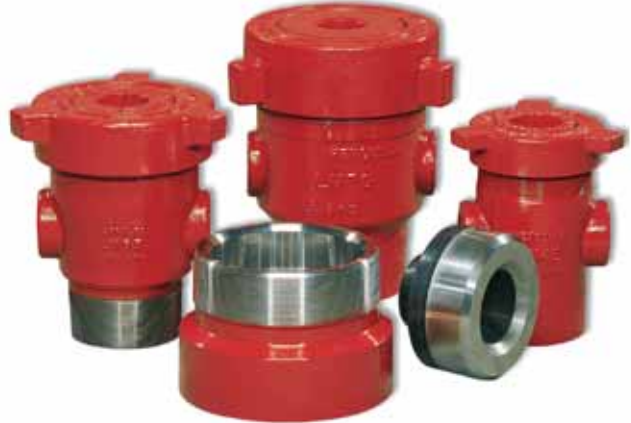
LM™ wellheads are patented