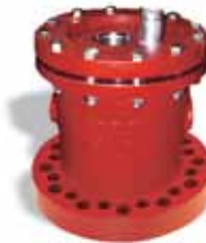
HHS with optional bottom flange