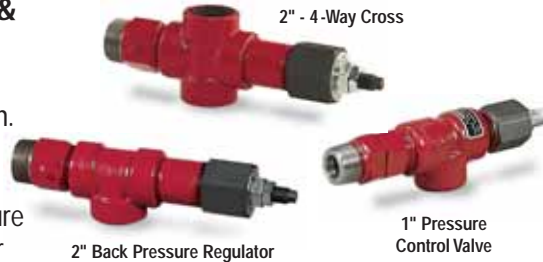
2" - 4-Way Cross