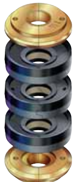
DOME® Packing Patented